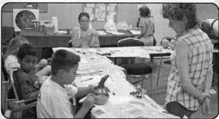
Kids Rock Art and Gourds class: