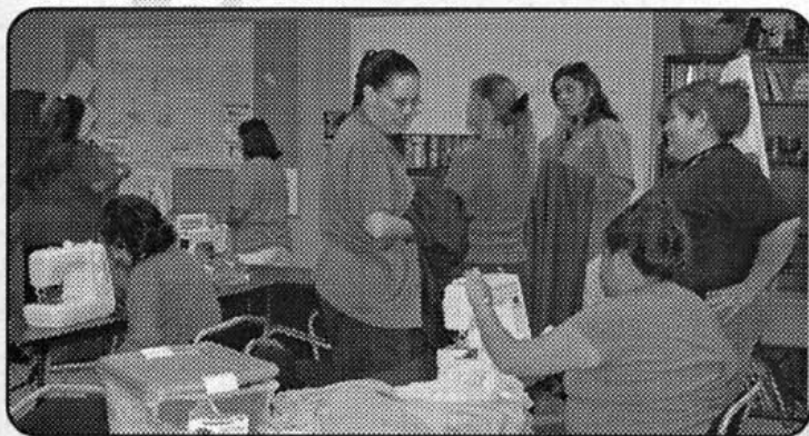
Shawl making class:

Below are many of the great activities the Museum participated in over the summer.