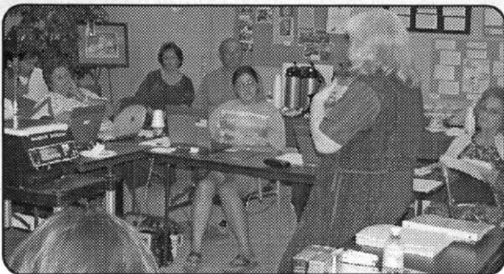
Tribal member participants from San Diego County attended the Tribal Digital Village's UC Davis Harrington Language Workshop at Barona Museum, July.

Developed in Canada, the First Voices project is an easy to use, secure, cost effective web-based tool enabling any language group to develop their own authentic and authoritative archiving and language reference resource in their own communities. The First Voices workshop I attended enables me to teach others how to use and add to the First Voices web database using audio and video files to enhance and clarify specific languages dictionary words, in Barona's case, Kumeyaay. The Barona dictionary will be put online (awaiting council's approval) for the community to access with a secure password. Any community members interested in being involved with this, or the Harrington project, please contact the Museum. As you can see, the Cultural Center and Museum is busy with the Barona Community in mind. Please stop by to see the Museum and feel free to volunteer and be involved at any level.