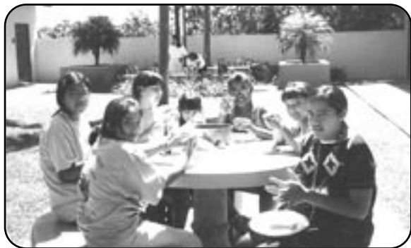
Kids from Cahuilla reservations attend the Museum class at the Tekakwitha Conference in Point Loma.

Museum committee meeting. Please call for information and to verify date.