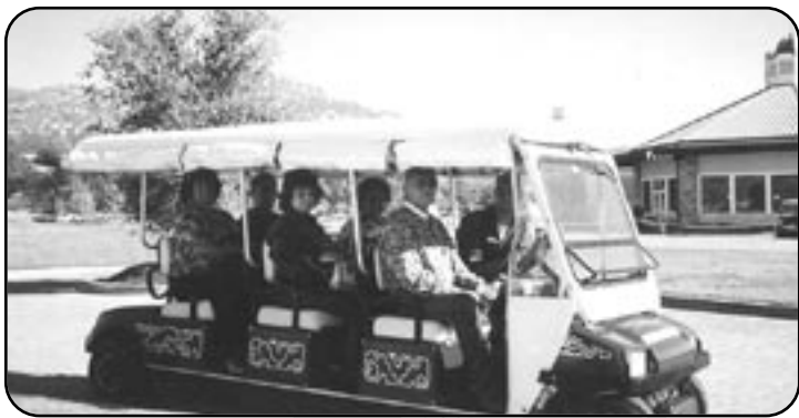
San Diego County Tribal Seniors enjoyed a tour of the Barona Creek Golf Course.

REMEMBER: At age 55, Barona Community members are eligible for the Senior events. Please call to add your name to the mailing list! We are having great fun. The Golden Years are not what they used to be!